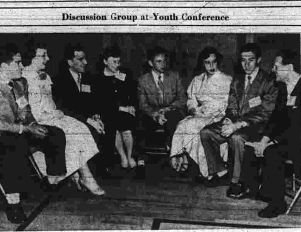
Several Manchester High School students were among the 100 county H-Y and Y-Teen members who attended the youth conference yesterday at Verplanck School.